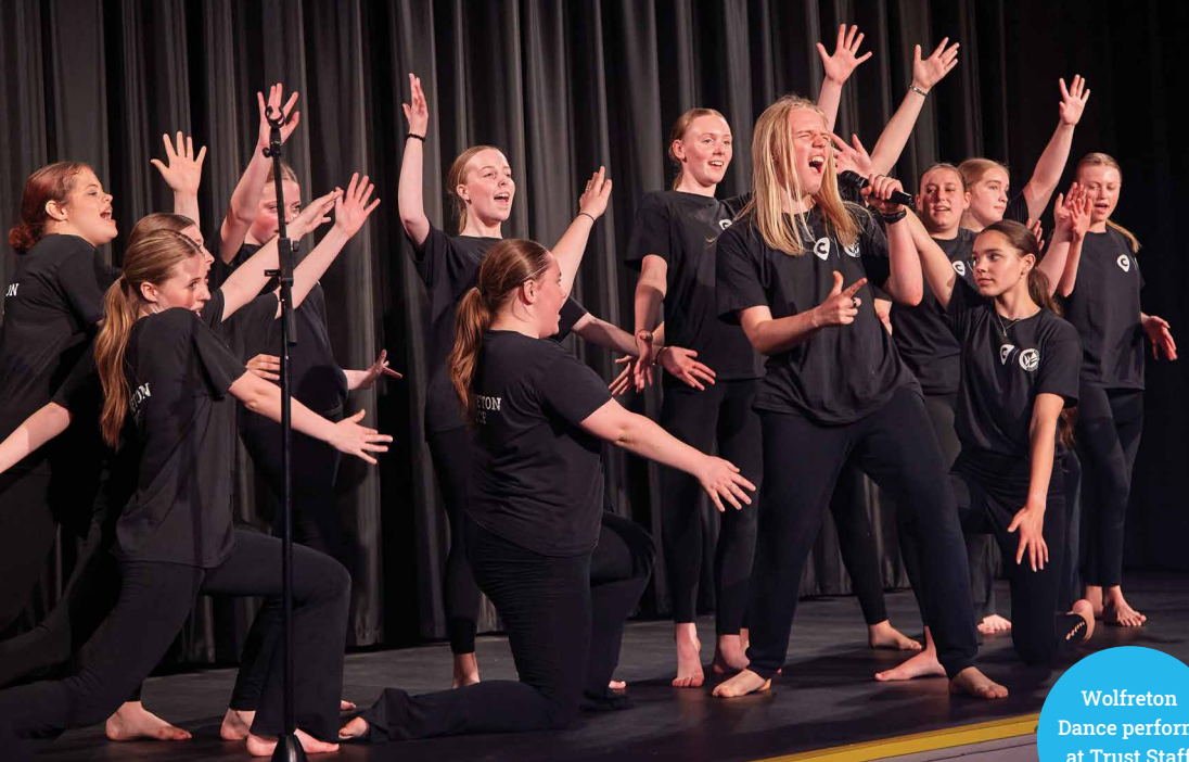
Wolfreton Dance perform at Trust Staff Awards