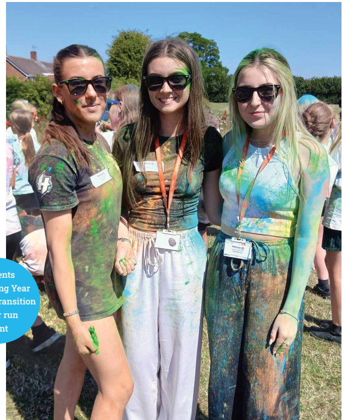
Students supporting Year 6s at our transition colour run event

We believe students succeed best when school and home work together. Families are kept informed through newsletters, letters, and Instagram, while our Parent Services Administrator and Pastoral Managers provide dedicated support. We work to celebrate successes, and aim to address concerns quickly, building the strongest foundations for every child's future.