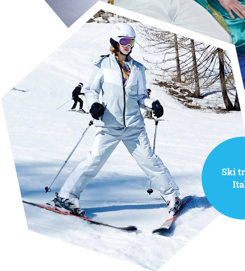
Ski trip to Italy