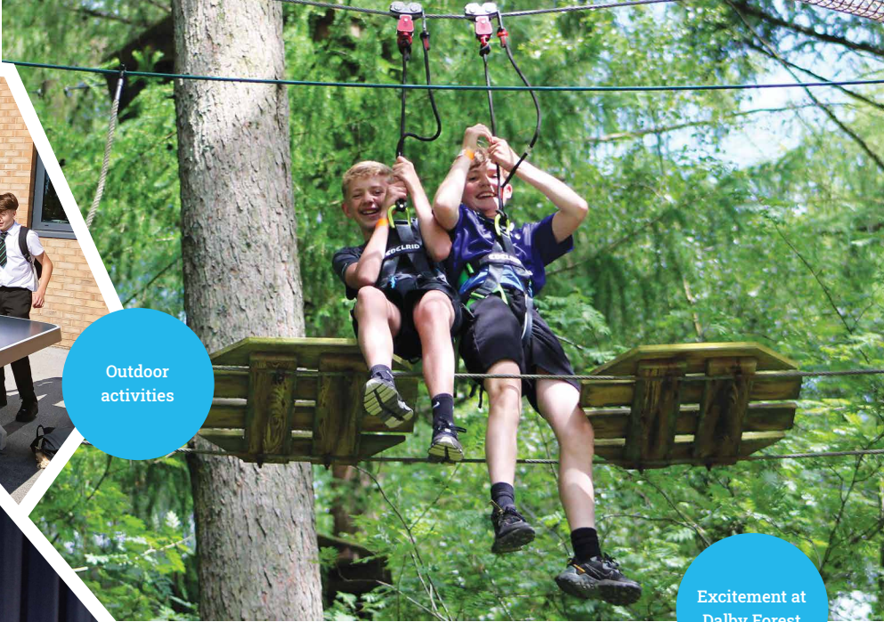
Excitement at Dalby Forest