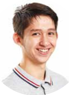
Samuel Cottingham Campus